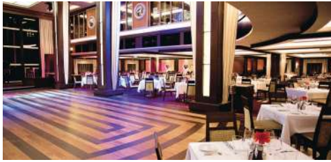
The Manhattan Room

The Manhattan Room is a Main Dining Room where guests can enjoy specially curated modern and classic dishes made with the freshest ingredients. Seating capacity: 532