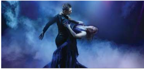
Burn the Floor®

Swiveling hips. Steamy embraces. High-octane tempos. Burn the Floor's performances aren't just hot, they sizzle. This renowned Broadway show brings ballroom and Latin dance theater to sea.