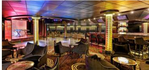
Bliss Ultra Lounge

Dance to a new beat and feel the excitement at Bliss Ultra Lounge, which brings a world-class club scene to sea. Seating capacity: 226