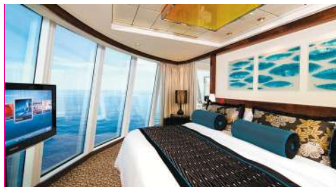
The Haven Deluxe Owner's Suite with Large Balcony