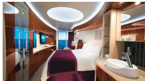
Club Balcony Suite