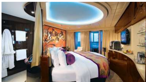
The Haven Courtyard Penthouse with Balcony