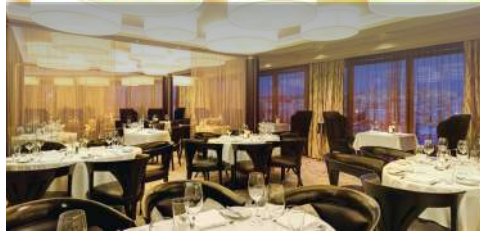
The Haven Restaurant

Savor an exclusive array of dishes for breakfast, lunch and dinner in a private restaurant serving the finest cuisine. Enjoy stunning vistas indoors or al fresco. Exclusively for guests of The Haven. Seating capacity: 57