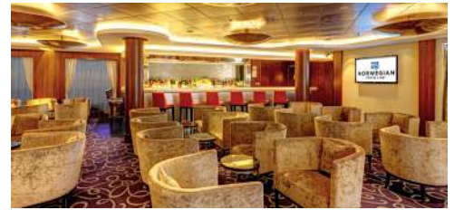
Shaker's Martini Bar

Happy hour comes shaken or stirred at this classic martini bar with a twist. Join the martini crowd for a cosmopolitan ambience. Seating capacity: 66