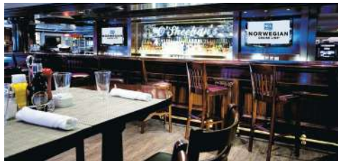
O'Sheehan's Neighborhood Bar & Grill

Try a few of the many beers on tap and catch a game on the two-story TV screen or play some billiards or darts. Seating capacity: 212